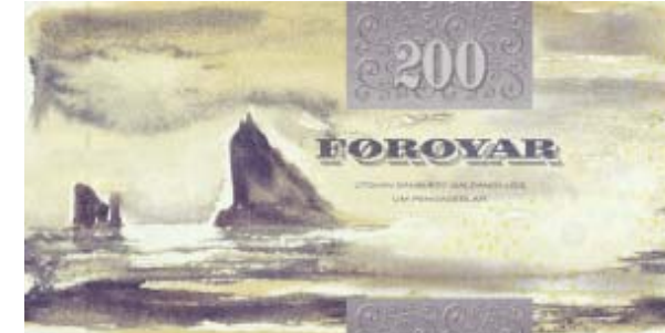
Format: 145x72 mm. Issued on 19 January 2004