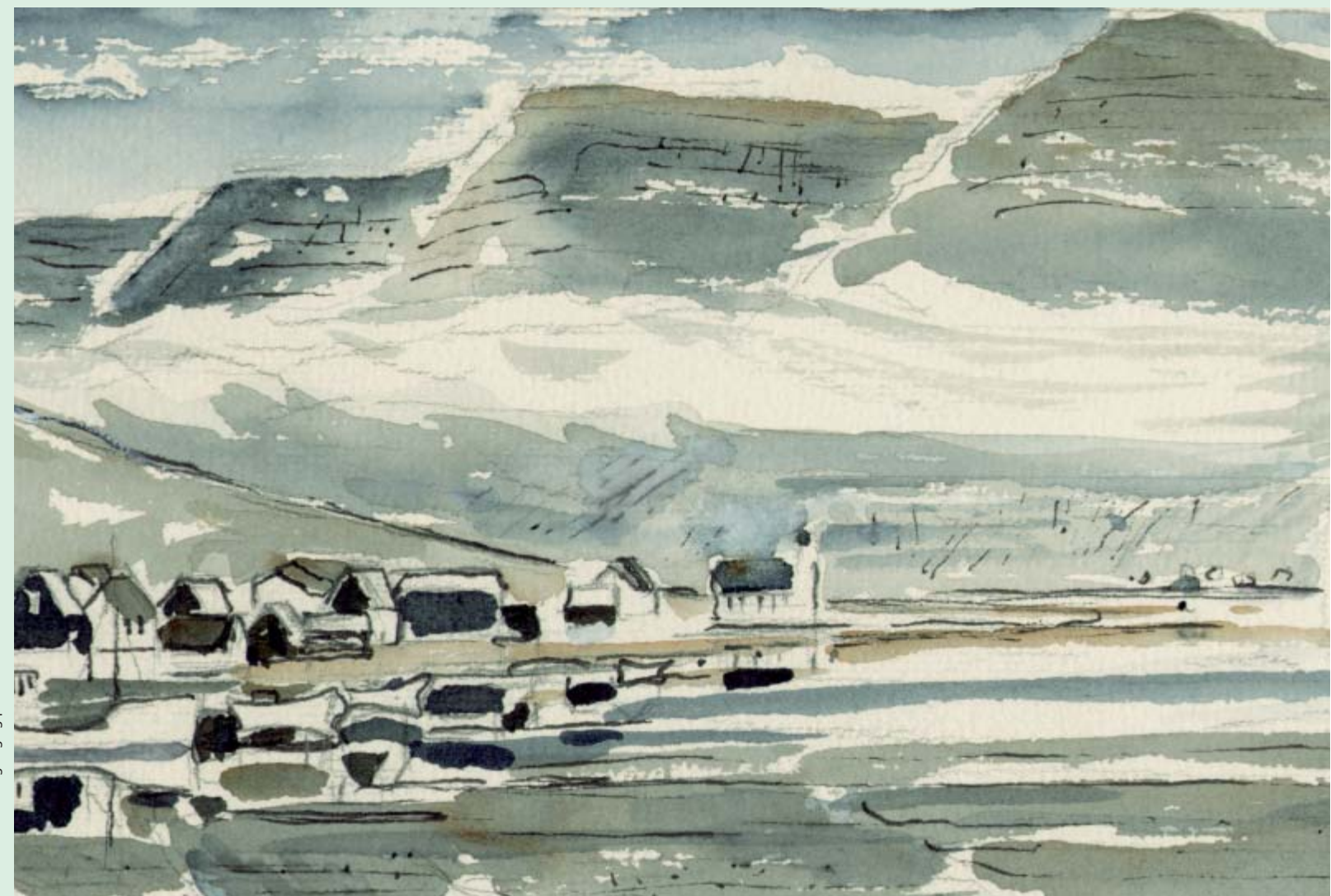
Grafisk tilrettelægning og print: Danmarks Nationalbank

Danmarks Nationalbank Havnegade 5 DK-1093 Copenhagen K