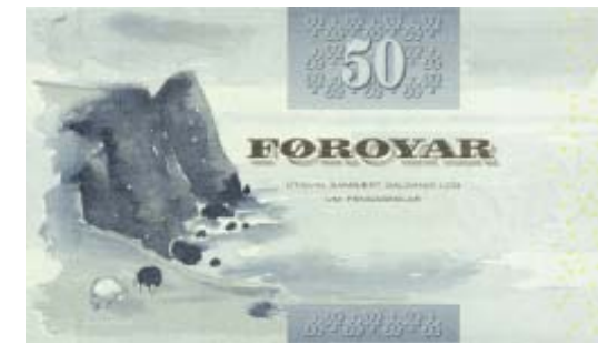
Format: 125x72 mm. Issued on 3 July 2001.