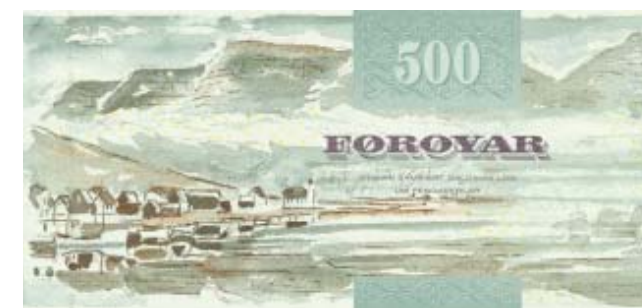
Format: 155x72 mm. Issued on 30 November 2004.