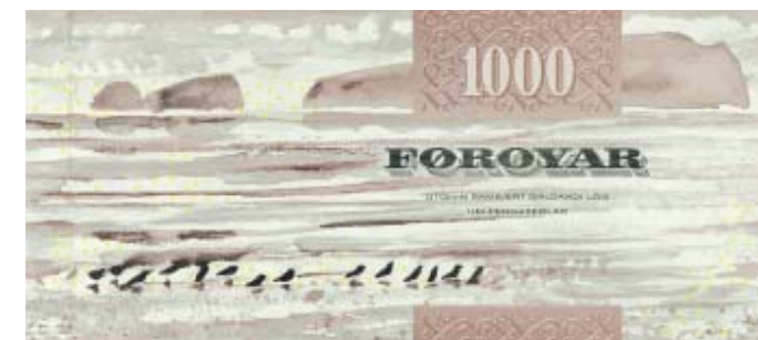
Format: 165x72 mm. Issued on 15 September 2005.