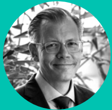
Ulrich Bindseil Director General, Market Infrastructure & Payments European Central Bank