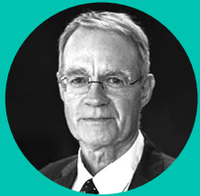
Per Callesen Governor Danmarks Nationalbank