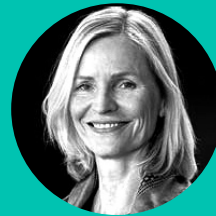
Signe Krogstrup Governor Danmarks Nationalbank