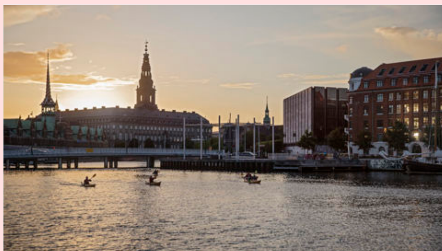
The Danish economy remains strong

Based on the Ministry of Finance's latest forecast, a total financing need of kr. 77 billion is expected in 2024